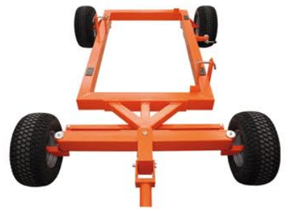
Machine body trolley (on request)