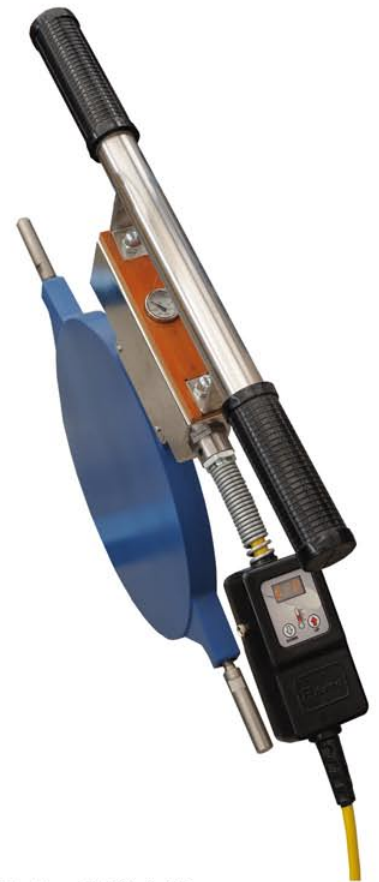
Heater with Digital Dragon