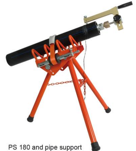
PS 180 and pipe support